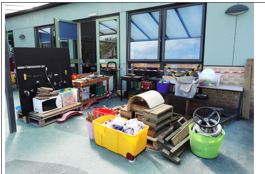
Part of our loose parts construction area