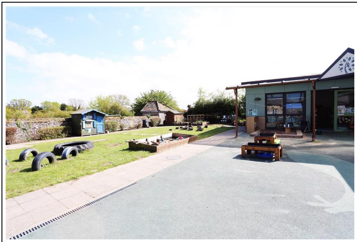
Our EYFS outdoor area