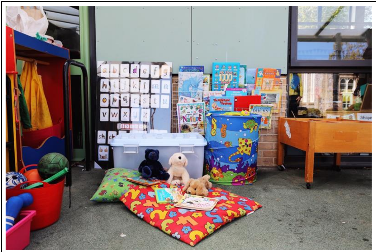
Outdoor reading area