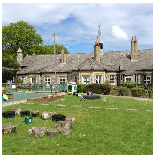
Our School building viewed from the EYFS outdoor area.

We hope that you find this booklet useful. If you have any questions, please come and speak to us, as we are happy to help!