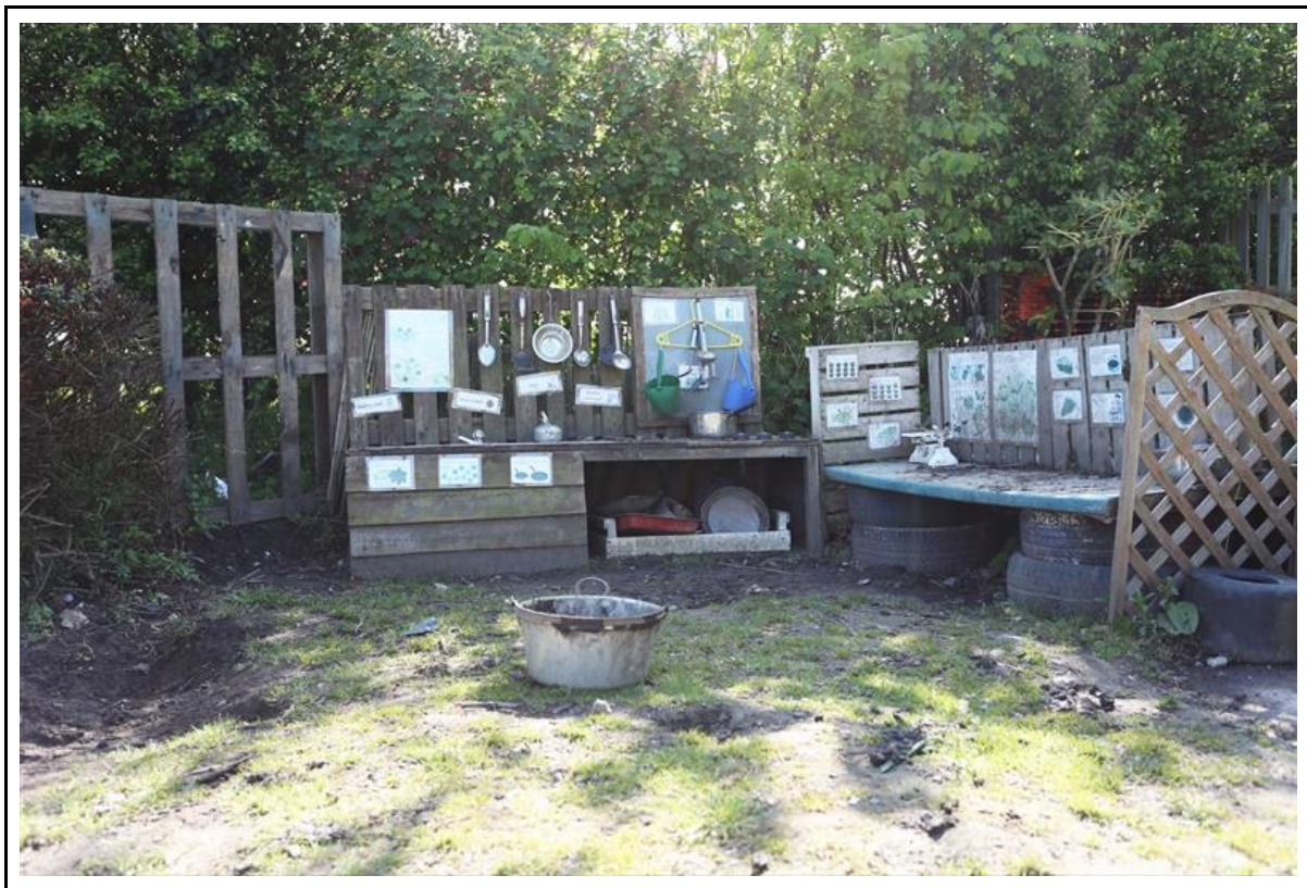
The Mud kitchen